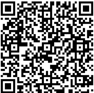
Google MyMaps QR Code